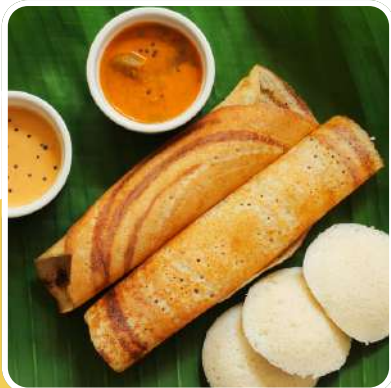
DOSA & IDLY